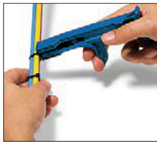
Step 2) Tension