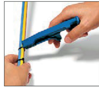
Step 3) Twist To Cut

The information provided in this product specification sheet is based on our experience and knowledge to date and we believe it to be true and reliable. This information is intended as a guide for your use of our products, the use of which is entirely at your own discretion and risk. We, BS Teasdale & Son Ltd, cannot guarantee favourable results and assume no liability in connection with the use of our products. © 2023 BS Teasdale & Son Ltd. All Content, Data & Images are owned by BS Teasdale & Son Ltd and are protected by international copyright law.